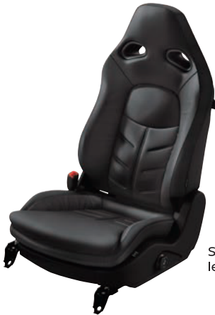
Samurai Black Semi-aniline leather accented