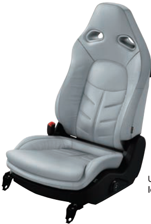
Urban Grey Semi-aniline leather accented