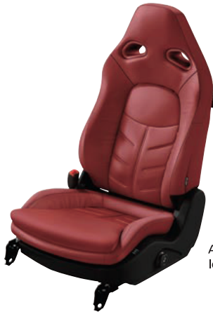
Amber Red Semi-aniline leather accented