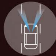
Lane Departure Warning