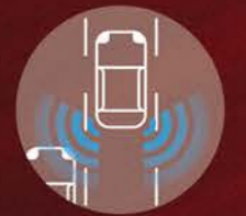
Blind Spot Warning