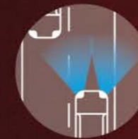
High Beam Assist