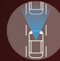
Intelligent Emergency Braking