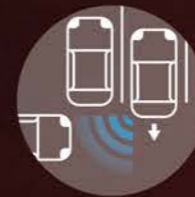
Rear Cross Traffic Alert