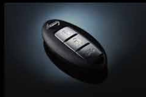
Intelligent Key. The Nissan Sylphy comes with an Intelligent Key that works with the push-button ignition. It easily locks and unlocks the doors and trunk.