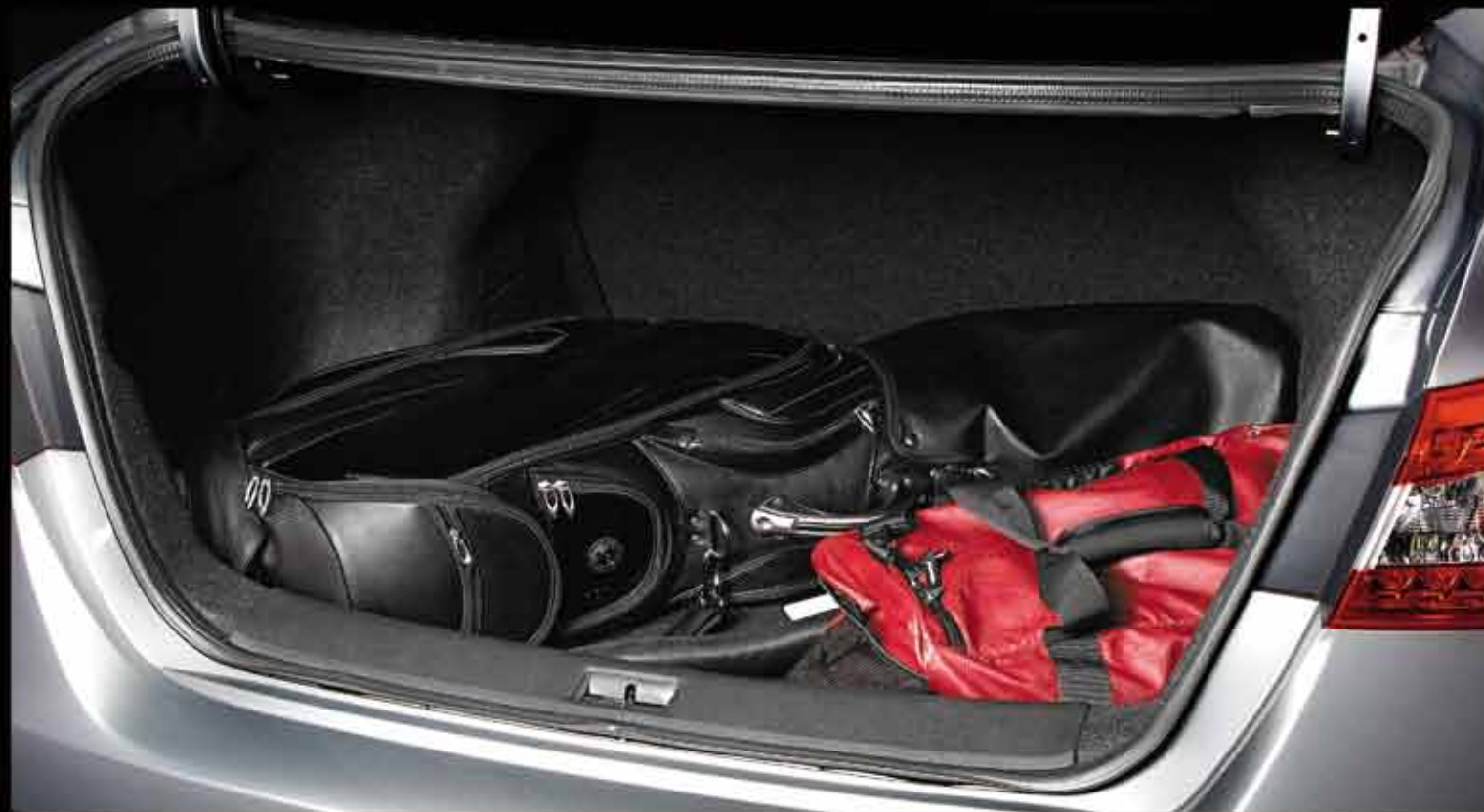
Trunk Space. Its massive 510 liter trunk capacity serves various lifestyles.