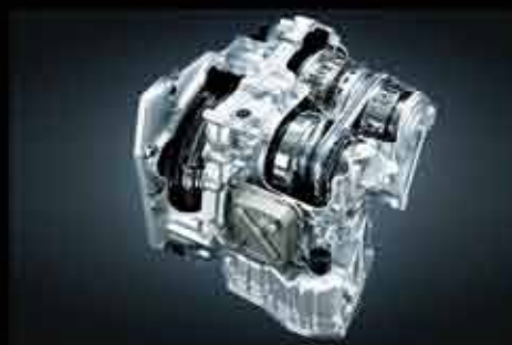
XTRONIC CVT. Its smart design allows for powerful acceleration and effortless cruising with great fuel efficiency.