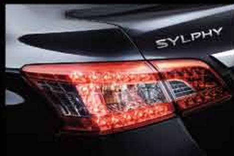
LED Tail Lights. Specifically designed to harmonize with the Nissan Sylphy's sleek bodyline, making it clearly visible from a distance, especially at night.