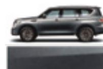
Gun Metallic Gray