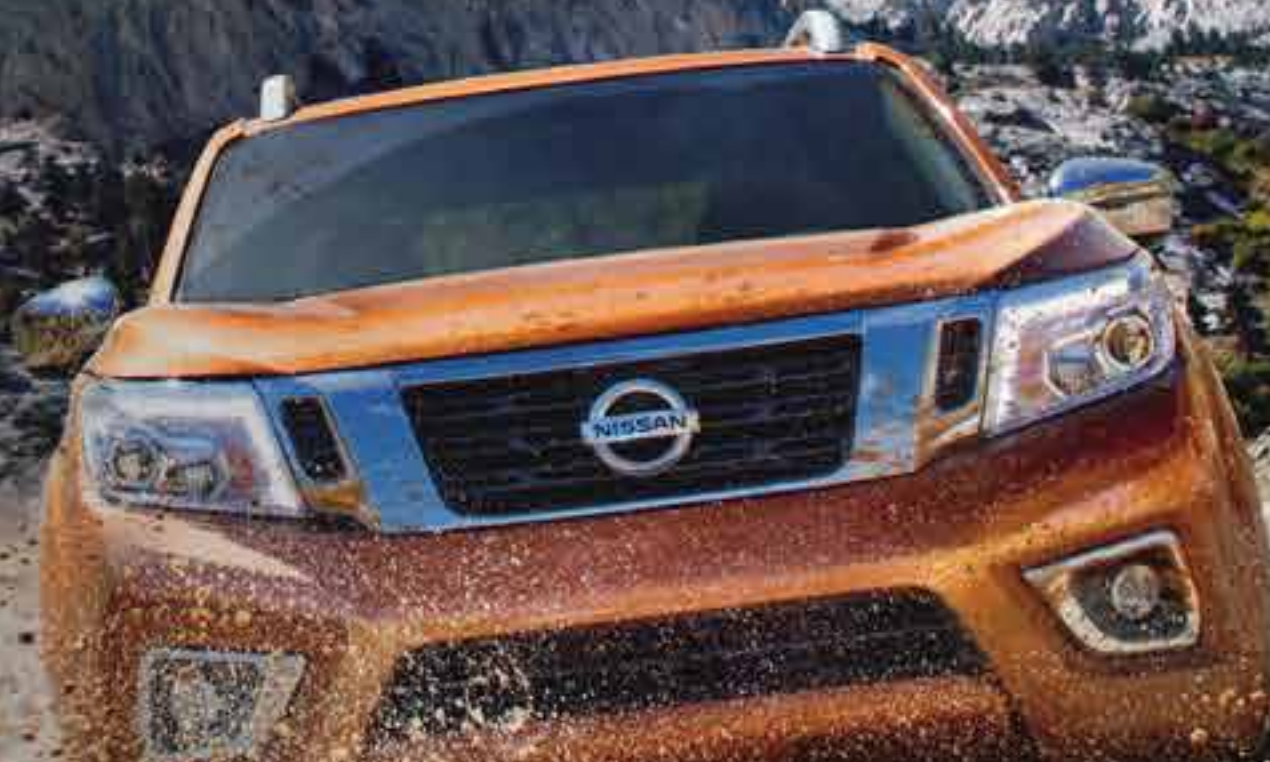
Photo may vary from actual unit. Nissan Philippines, Inc. reserves the right to alter, delete, or enhance features and specifications without prior notice, depending on market requirements.

We've been building strong, dependable pickups longer than you've been driving them. At every turn, we've ridden the edge of innovation to deliver a tested and proven fully boxed frame, a world-class engine, and a go-anywhere 4x4 command. Now, it's time to experience the excitement of the next generation of trucks where a heritage of tough meets premium ride comfort, smart technologies, and sleek, modern styling. The Nissan Navara takes you from a day on the job straight to a night on the town without missing a beat.