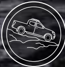
Hill Descent Control*