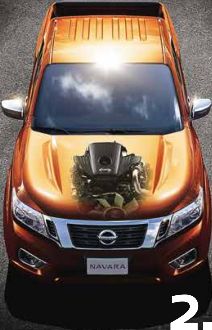
Photo may vary from actual unit. Nissan Philippines, Inc. reserves the right to alter, delete, or enhance features and specifications without prior notice, depending on market requirements.

*Available in EL Calibre, 4x4 EL, and 4x4 VL variants