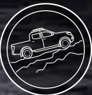
Hill Start Assist*

*Available in 4x4 EL and 4x4 VL variants