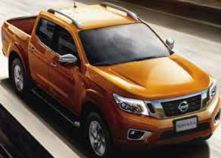
Photo may vary from actual unit. Nissan Philippines, Inc. reserves the right to alter, delete, or enhance features and specifications without prior notice, depending on market requirements.

What if the most rugged pickup in the off-road could ride as smoothly as most sedans do on the highway? Load up your family or grab a few friends and find out. Experience the smooth and comfortable ride that comes with a double-wishbone front suspension and a 5-link rear suspension. With its 7-speed automatic transmission, it's as capable in the off-road as it is smooth on the paved ones while being fuel-efficient. So go ahead and detour with confidence.