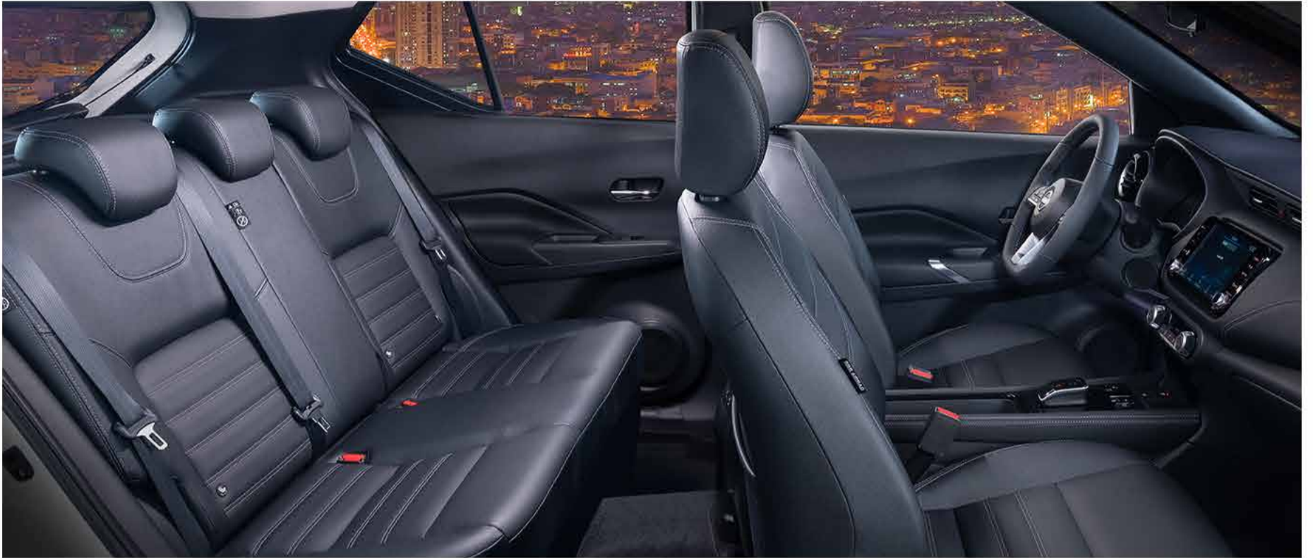
LEATHER SEATS WITH CONTRAST STITCHING

Materials and features are all carefully selected and designed to give you absolute comfort so that you can enjoy the journey as much as the destination.