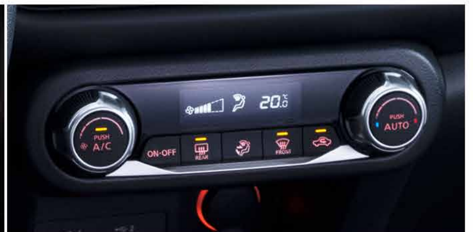
AIR-CONDITIONING SYSTEM WITH AUTOMATIC CLIMATE CONTROL

Photo may vary from actual unit. Nissan Philippines, Inc. reserves the right to alter, delete, or enhance features and specifications without prior notice, depending on market requirements.