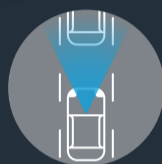
Intelligent Forward Collision Warning