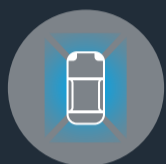
Intelligent Around View Monitor

Drive with complete confidence at every turn. Whether you're getting out of a tight parking space or cruising on the highway, a system designed for safety leads the way.