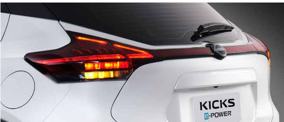
REAR COMB LAMP FINISHER