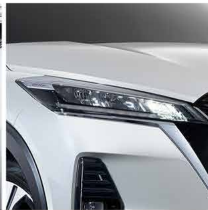
FULL LED HEADLAMPS WITH DAYTIME RUNNING LIGHTS