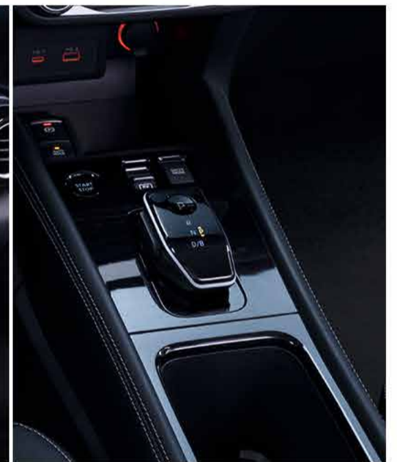
ELECTRONIC GEAR SELECTOR WITH ILLUMINATION