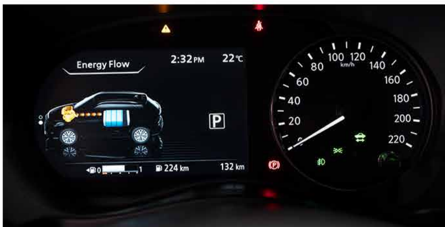
7" TFT METER WITH ADVANCED DRIVE ASSIST DISPLAY