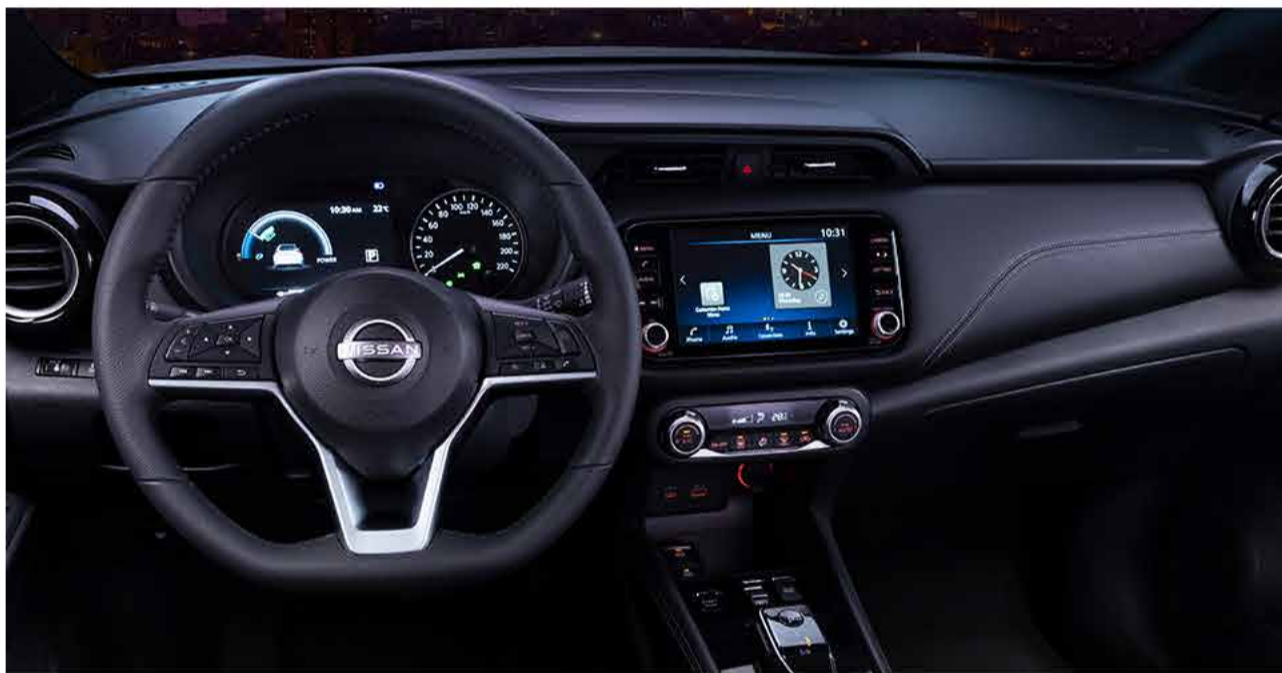
BLACK LEATHER TRIMS WITH SOFT TOUCH MATERIALS