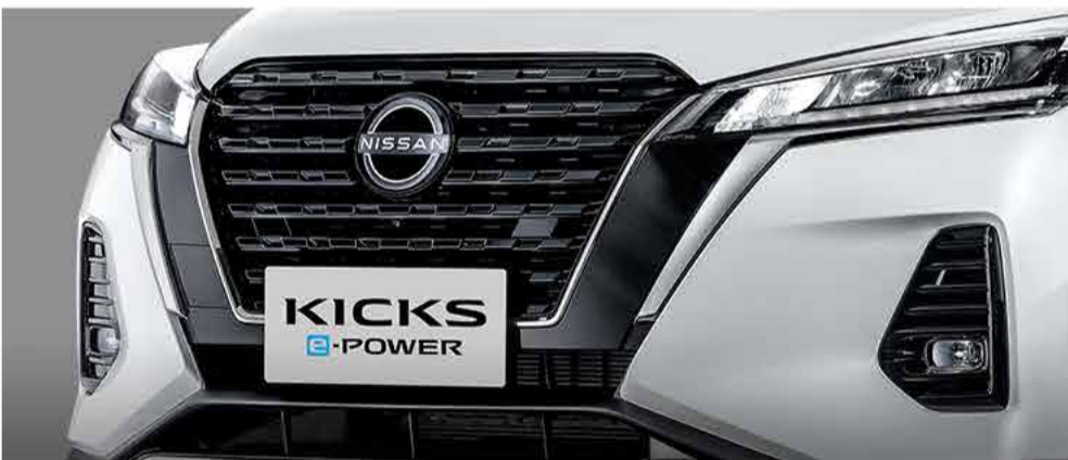
V- MOTION GRILLE DESIGN