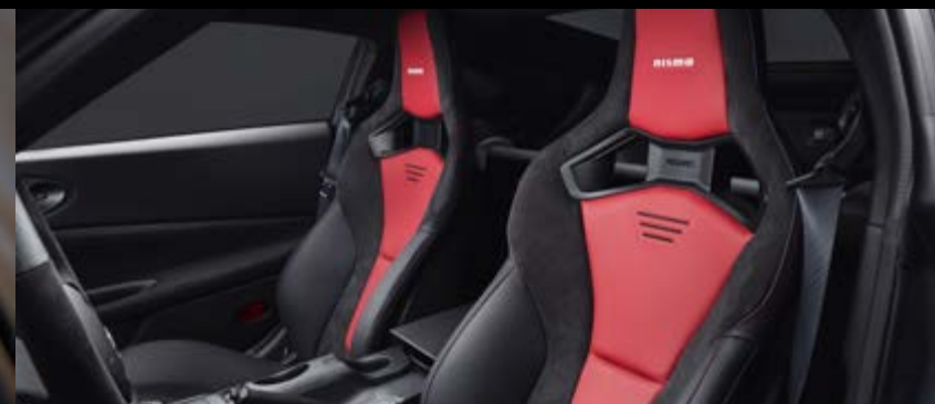
NISMO branded exclusive Recaro leather accented and Alcantara