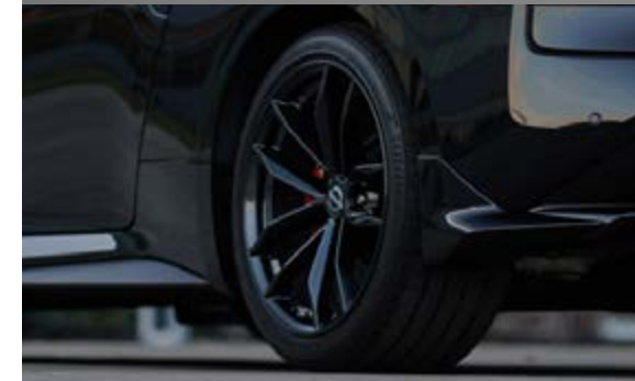
Splash Guards - Front and Rear

Nissan Genuine Accessories keep your vehicle complete and help maintain its resale value.