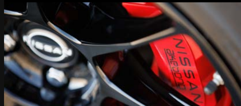
19" x 10J" front & 19" x 10.5J" rear gloss black painted forged alloy wheels by RAYS®