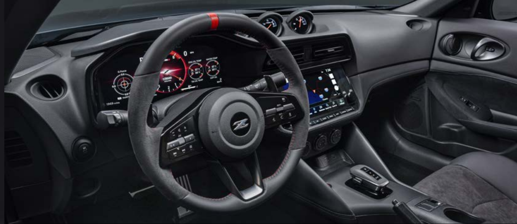
NISMO leather accented and Alcantara-appointed steering wheel