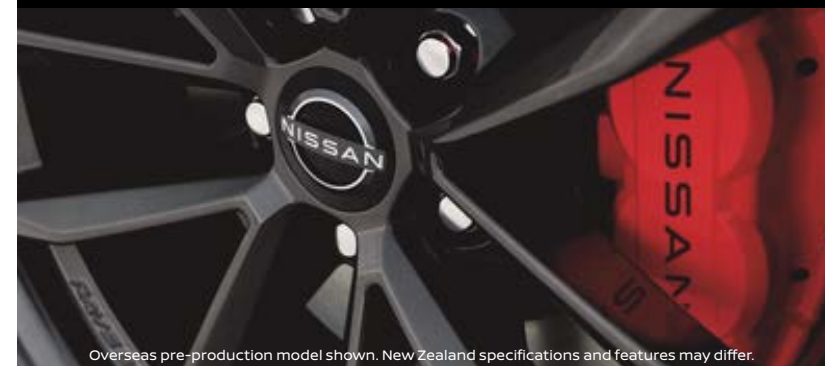
Overseas pre-production model shown. New Zealand specifications and features may differ.