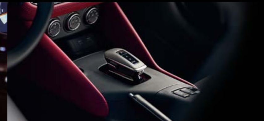
Shift by Wire Automatic transmission