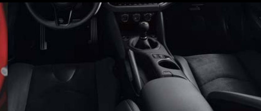
Leather accented ^ seat trim