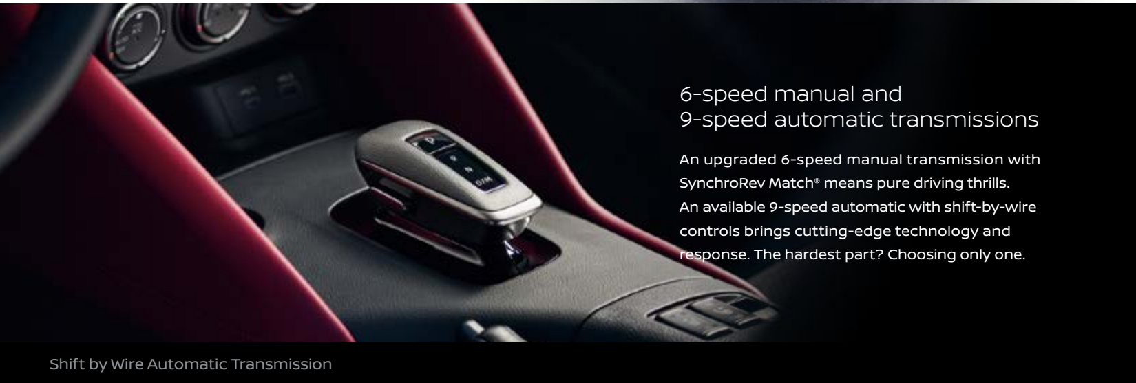
Shift by Wire Automatic Transmission

An upgraded 6-speed manual transmission with SynchroRev Match® means pure driving thrills. An available 9-speed automatic with shift-by-wire controls brings cutting-edge technology and response. The hardest part? Choosing only one.