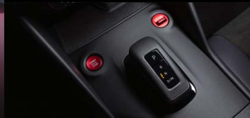
NISMO-exclusive red anodized engine start and Drive Mode buttons