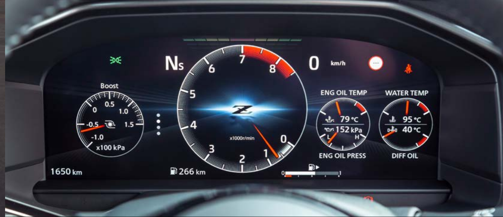
12.3" TFT Advanced Drive-Assist Display instrument cluster