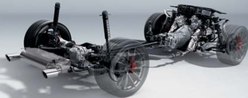
Overseas pre-production model shown. New Zealand specifications and features may differ.

The Nissan Z is designed to handle your favourite roads with new monotube shock absorbers and suspension tuning for enhanced response. Strong and lightweight aluminum and carbon-fiber composite components, plus massive 19" forged alloy wheels by RAYS® with new performance tyres will give a G-induced smile in every turn.