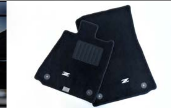
Floor Mats - Carpeted