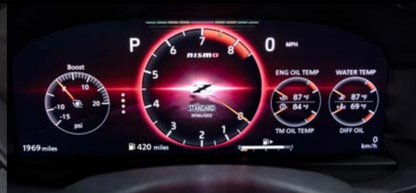
Fully digital TFT meter