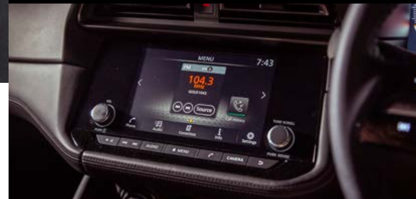
8" touchscreen display