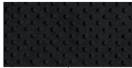
Red leather-accented* seat trim-