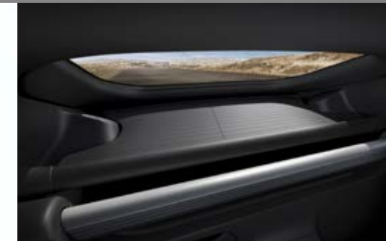
Soft Tonneau Cover