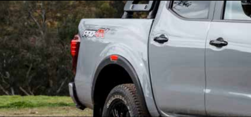
BLACK FENDER FLARES WITH RED ACCENTING