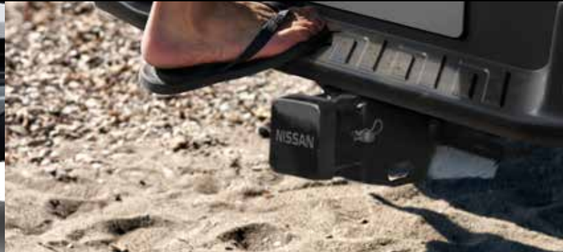
INTEGRATED BUMPER STEP*