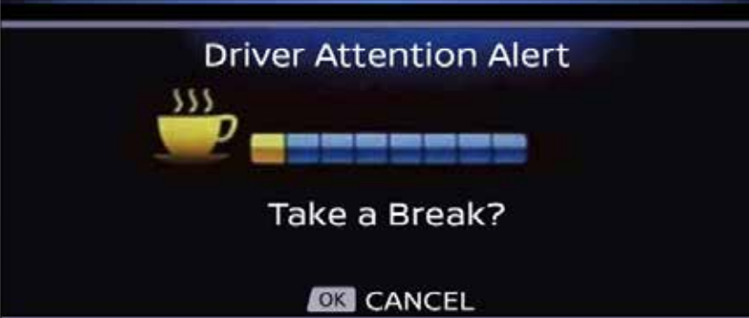
INTELLIGENT DRIVER ALERTNESS*