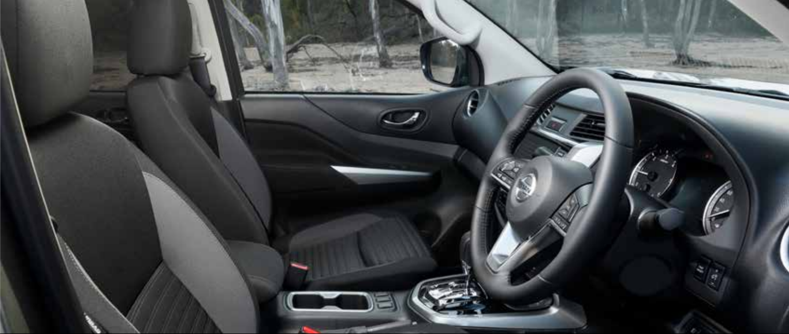
ST INTERIOR SHOWN