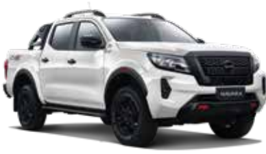
PRO-4X White Pearl*