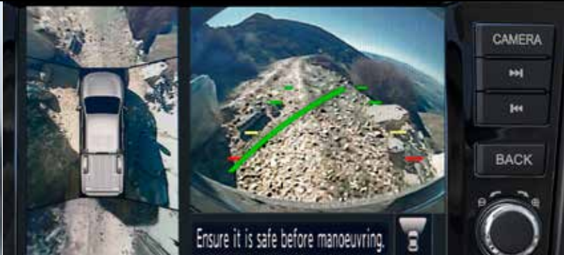
INTELLIGENT OFF-ROAD AROUND VIEW MONITOR**