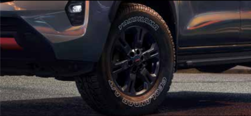
ALL TERRAIN TYRES