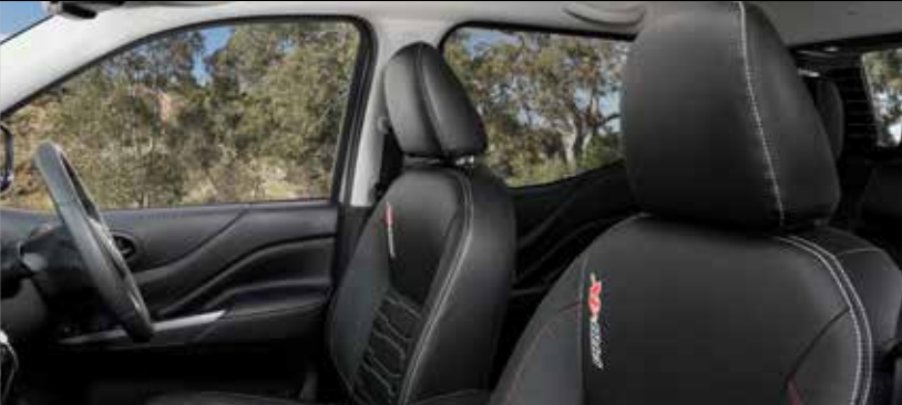
LEATHER ACCENTED* PRO-4X SEATS