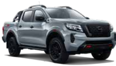
PRO-4X Stealth Grey*