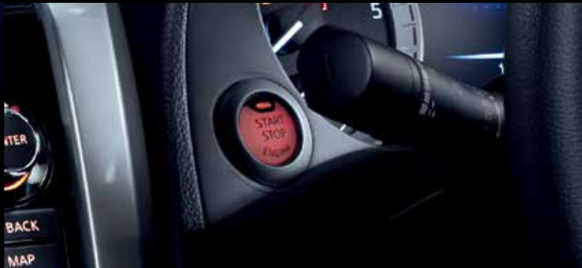
INTELLIGENT KEY WITH PUSH BUTTON ENGINE START