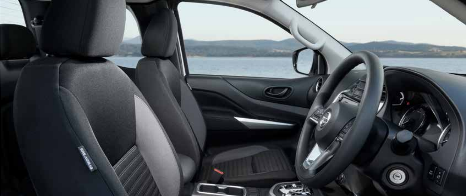
SL INTERIOR SHOWN