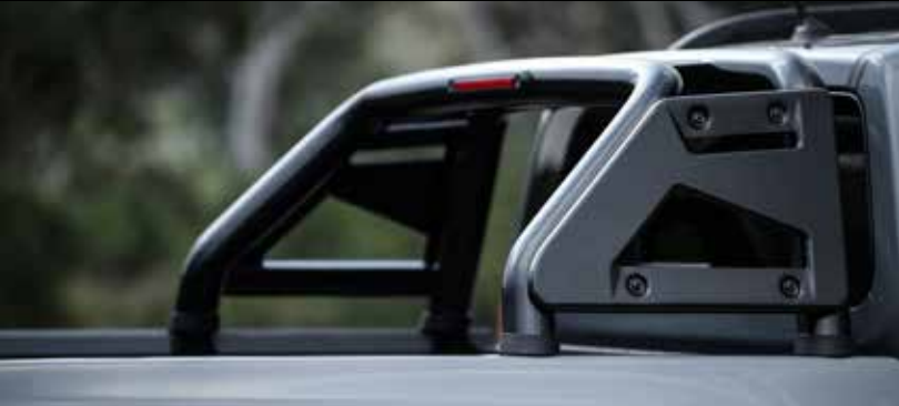
BLACK STAINLESS STEEL DOUBLE TUBE SPORTS BAR WITH SAIL PANEL*