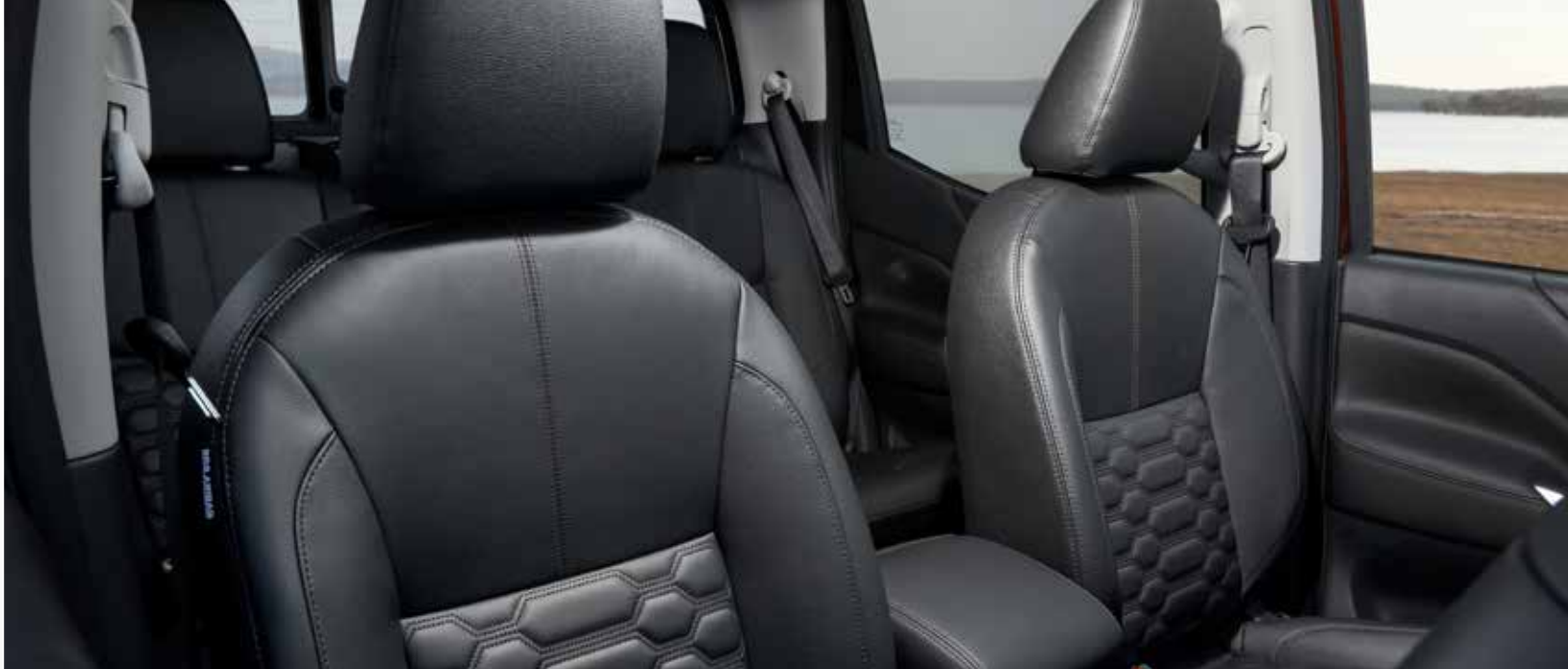
ST-X INTERIOR SHOWN