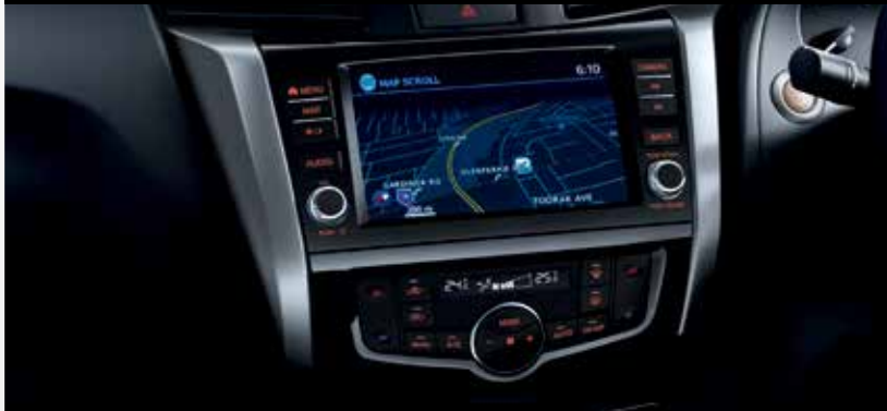
DUAL-ZONE CLIMATE CONTROL AIR-CONDITIONING