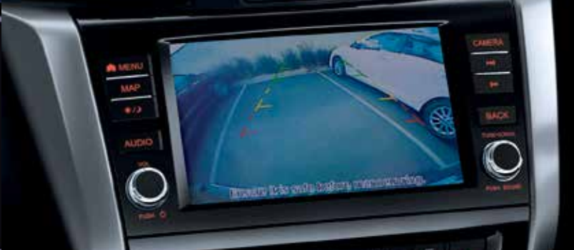
REVERSE PARKING CAMERA (WELLSIDE ONLY)