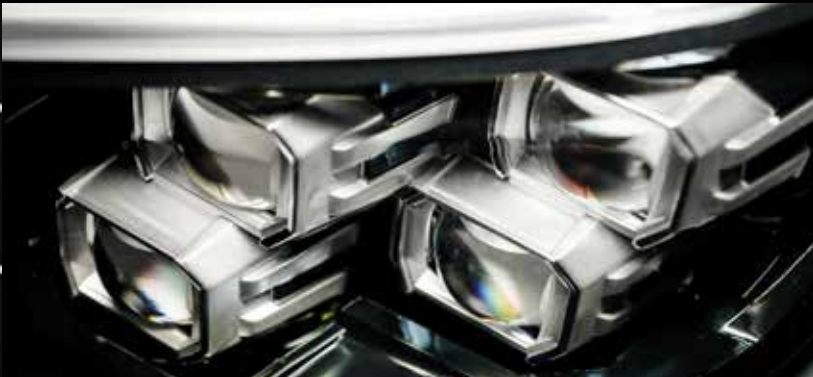
QUAD-LED HEAD LAMPS AND LED FOG AND TAIL LAMPS