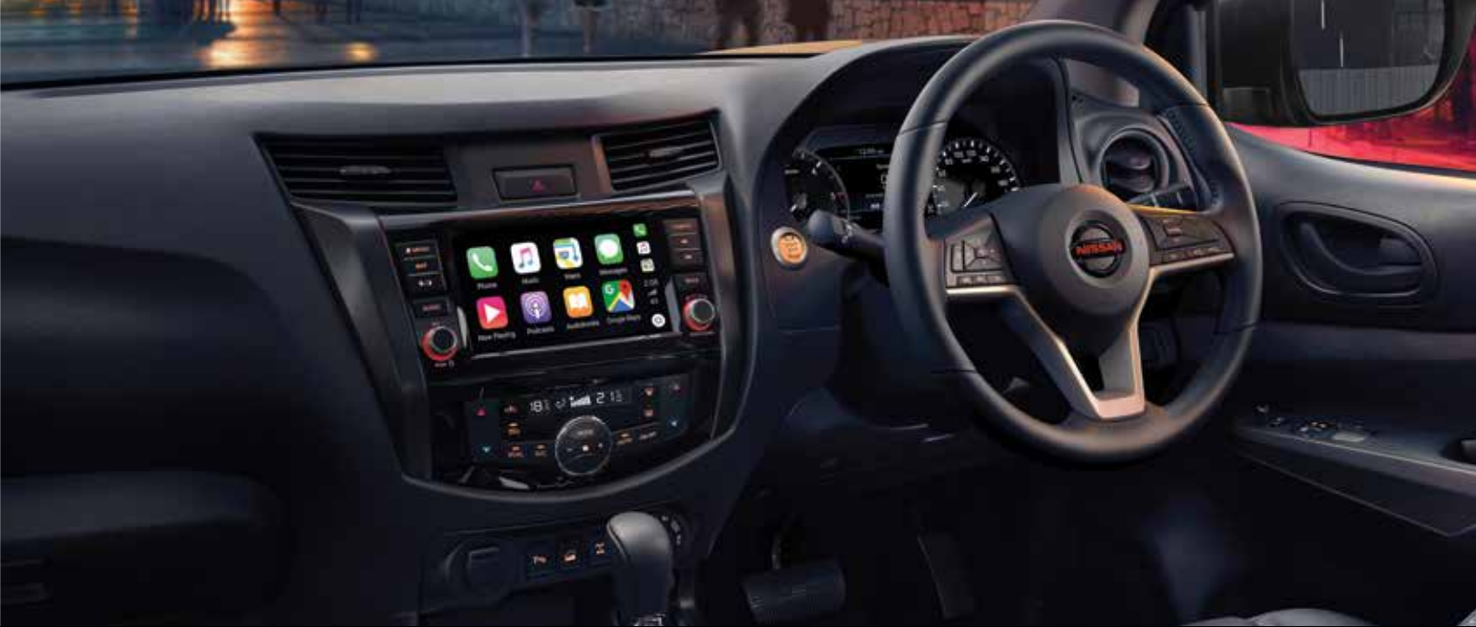
PRO-4X INTERIOR SHOWN