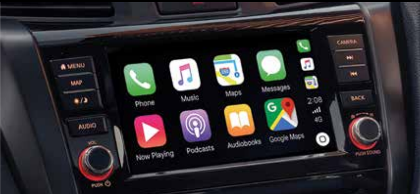
8.0" TOUCHSCREEN WITH APPLE CARPLAY® & ANDROID AUTO™*