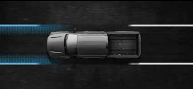
LANE DEPARTURE WARNING & INTELLIGENT LANE INTERVENTION*