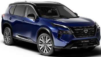
Deep Ocean Blue with black roof #~