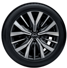
20" alloy wheel Standard on Ti-L e-POWER