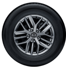
17" alloy wheel Standard on ST grades