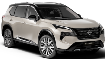
Champagne Silver with black roof #~