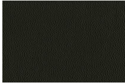
Black genuine leather-accented* seat trim. Available on ST-L & Ti