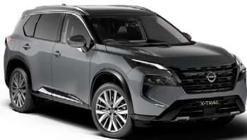
Gun Metallic #