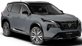
Ceramic Grey with black roof #~