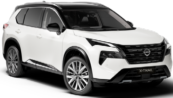
Everest White with black roof #~