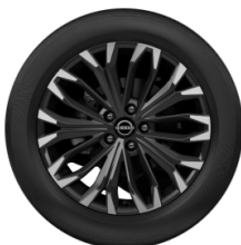
19" alloy wheel Standard on Ti grades Standard on Ti-L 2.5L