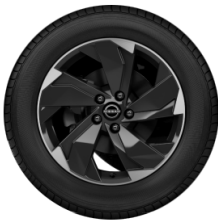
18" alloy wheel Standard on ST-L grades