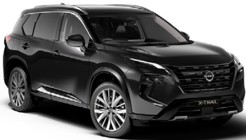
Diamond Black #