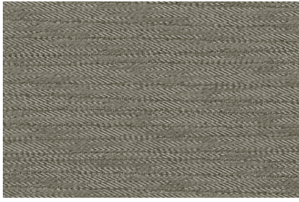
Light charcoal seat trim. Available on ST.