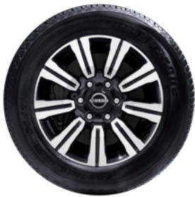
18" alloy wheel Standard on Ti and Ti-L grades